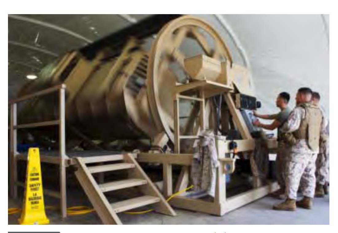
Training Aids, Devices, Simulators, & Simulations