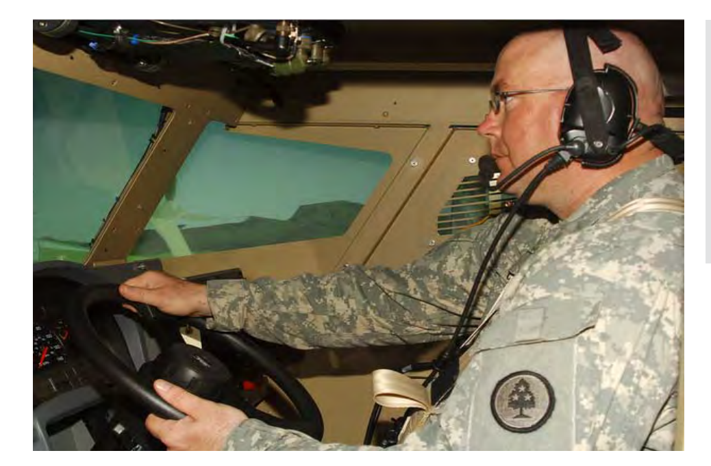
MRAP-CDT MRAP Common Driver Trainer Provides one station for MRAP drivers. Training can simulate RG 33, RG 31, Maxxpro, and Caiman vehicles.