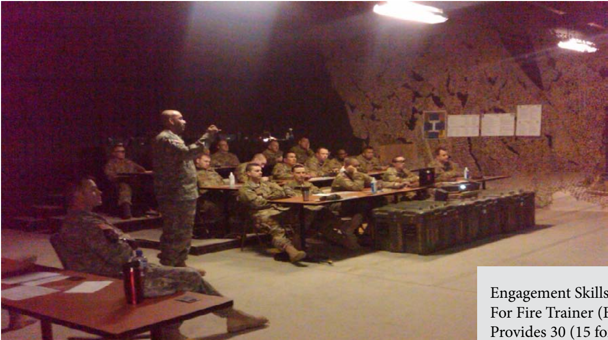
Engagement Skills Trainer/Call For Fire Trainer (EST/CFFT) Provides 30 (15 for M4, 15 CSW) lanes from M9 to M2 and AT4 as well as 12 CFFT stations.