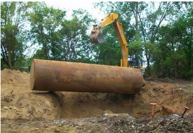
LUST ARRA Site: Interstate Truck Plaza of America, Inc. 6405 S.R. 17, Plymouth

To date, $2,851,630.33, or 71% of the state’s total award is obligated; work is underway or completed at 15 sites statewide; and, the state has stimulated economic growth by expending $1,236,680.12, or 31% of its LUST ARRA grant. A total of 29 USTs and 7631.77 tons of petroleum