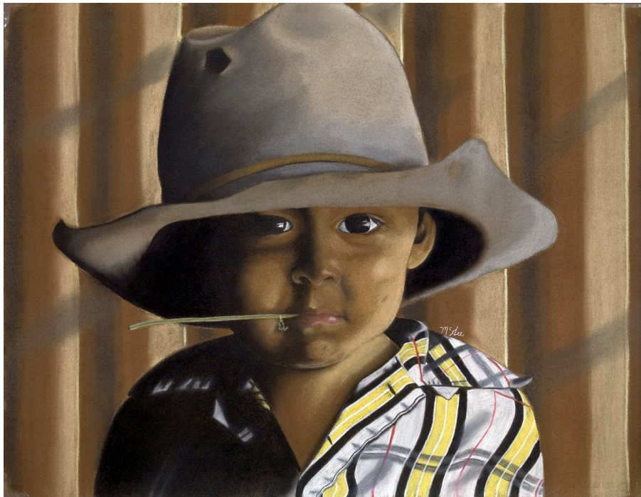
Example of the offender artwork

Fifty-seven pieces of art were produced by inmates at Westville Correctional Facility and submitted for consideration. Of those, 47 were selected by the Art Selection Committee to be sold by silent auction. In addition, 14 local businesses donated gift baskets/certificates for auction. The response from the community was astounding. Expecting approximately 75 – 100 individuals to attend the event, over 150 actually came out to support the auction.