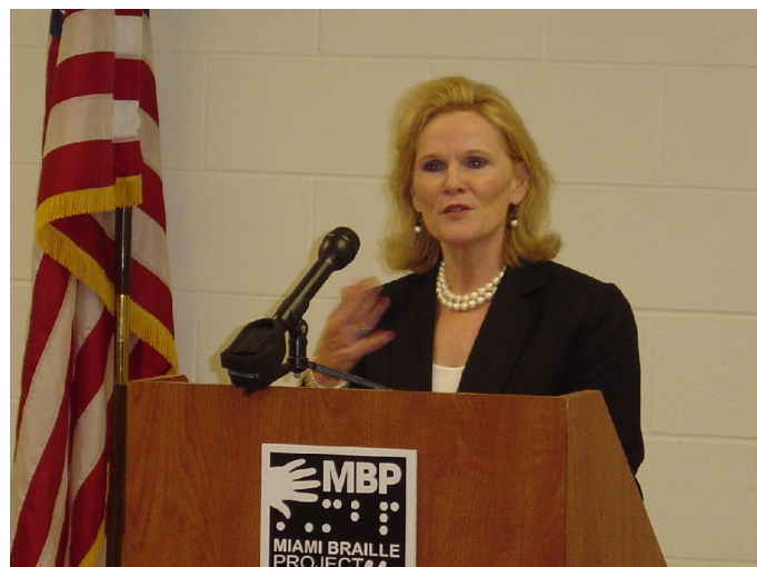
Senator Teresa Lubbers