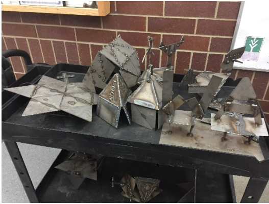
Metal artwork by graduating class