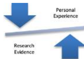
Figure 1: Tension Between Experience and Research

Despite their commitment to applying research to decision making, some criminal justice professionals express confusion over how to apply evidence when it conflicts with personal experience. How much emphasis should be placed on research versus experience? This tension is understandable, particularly when research is in opposition to intuition or experience (such as the empirically supported findings that providing programming to lower risk offenders can increase recidivism or that increasing the degree of punishment can increase recidivism). Even when research is not in opposition to beliefs or experience, outcomes are never a 100% guarantee (i.e., some false positives and false negatives are to be expected, regardless of the strength of the evidence), although, when following the evidence, favorable outcomes are more likely to occur than unfavorable outcomes.