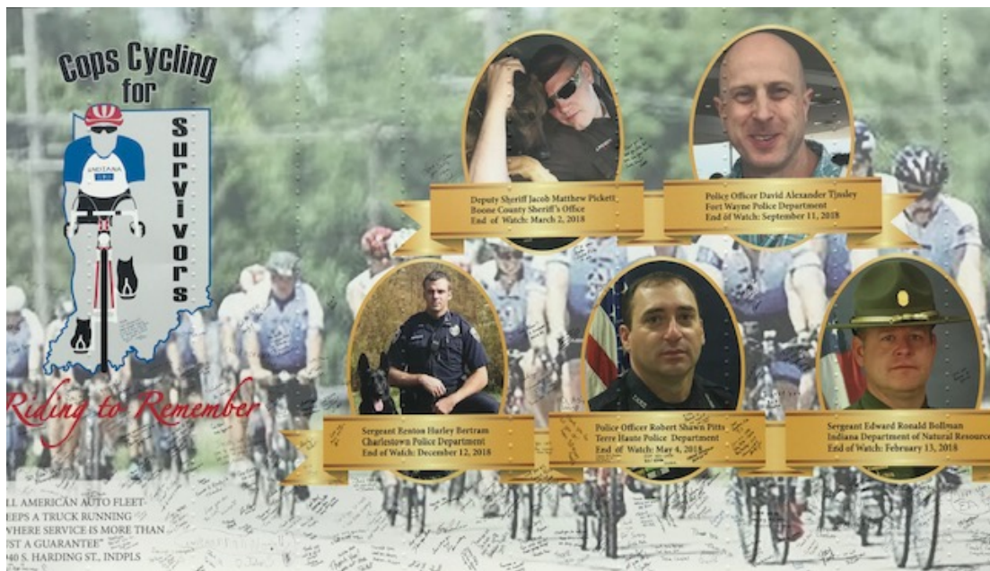
*The Memorial on the side of the truck which transports their equipment