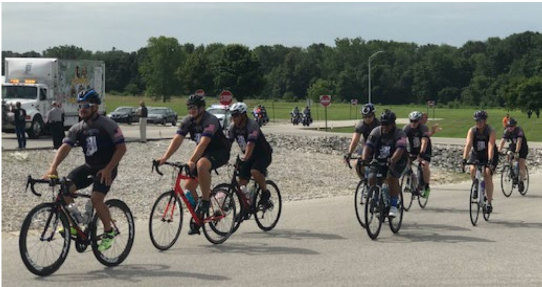
*Cops Cycling for Survivors