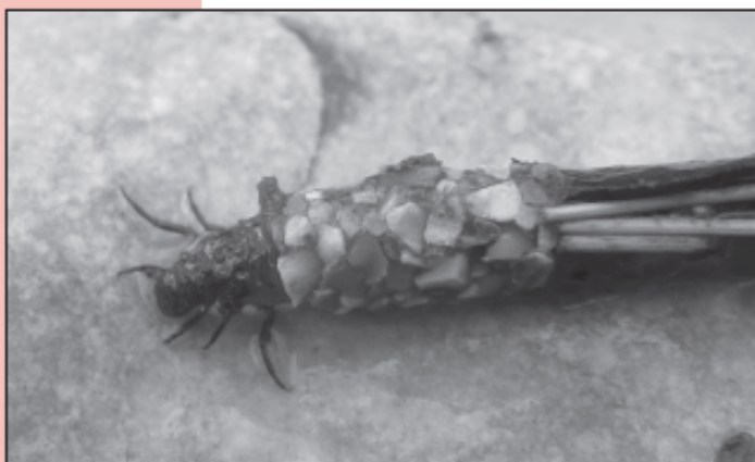
Some caddisfly larvae build cases out of materials like sand, twigs, leaves, and other debris.

Depending on the species, caddisfly mating can occur in flight, on the ground, or on vegetation near aquatic habitats.