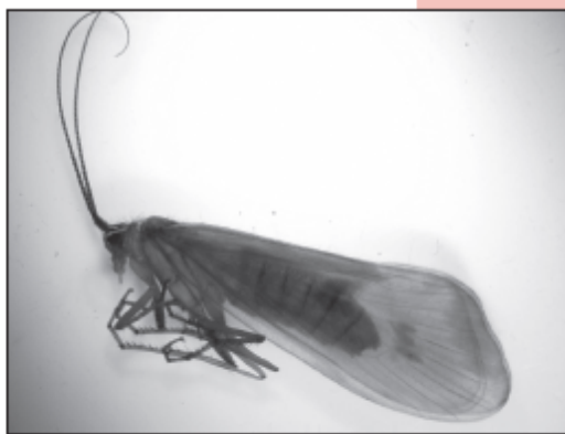
Adult caddisflies feed on nectar or not at all.

Our next fact sheet will cover the aquatic beetles, our largest and most diverse group of insects. Don't forget to send your questions to streamteam@mdc.mo.gov or call 1-800-781-1989.