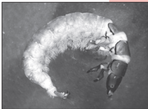
Hydropsyche orris , a common net spinning form of caddisfly.

Caddisflies are important in water quality monitoring, but temperature and oxygen levels aren't always the limiting factors for these insects. Caddisflies are sensitive to a variety of pollutants and, while case builders are more tolerant of low oxygen levels, free living forms and net spinners require cool, flowing, highly oxygenated water. No matter what the particulars of the species, when we find caddisflies in our streams, with or without stoneflies and mayflies, we are excited!