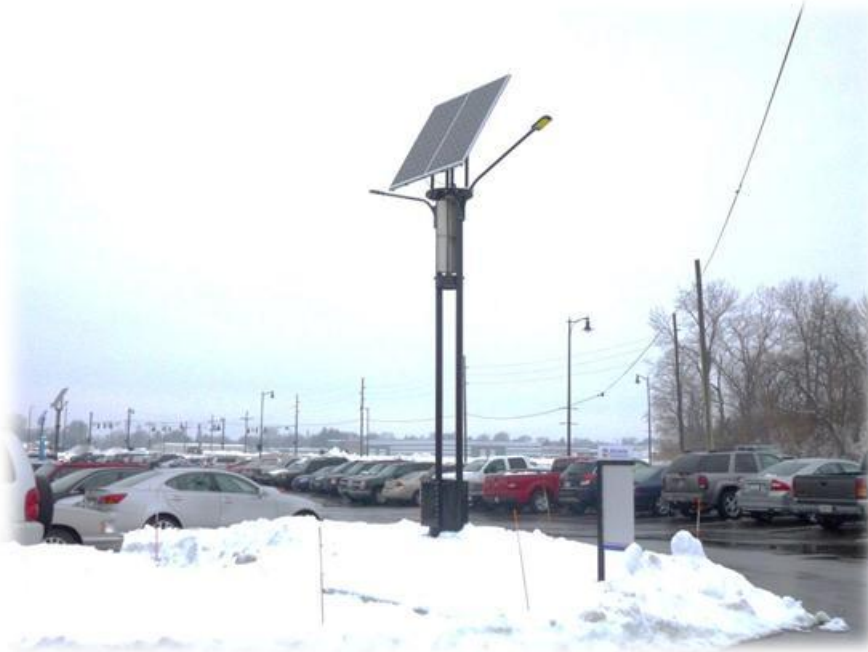
Solar and Wind Powered Street Lights Completely “Off the Grid”