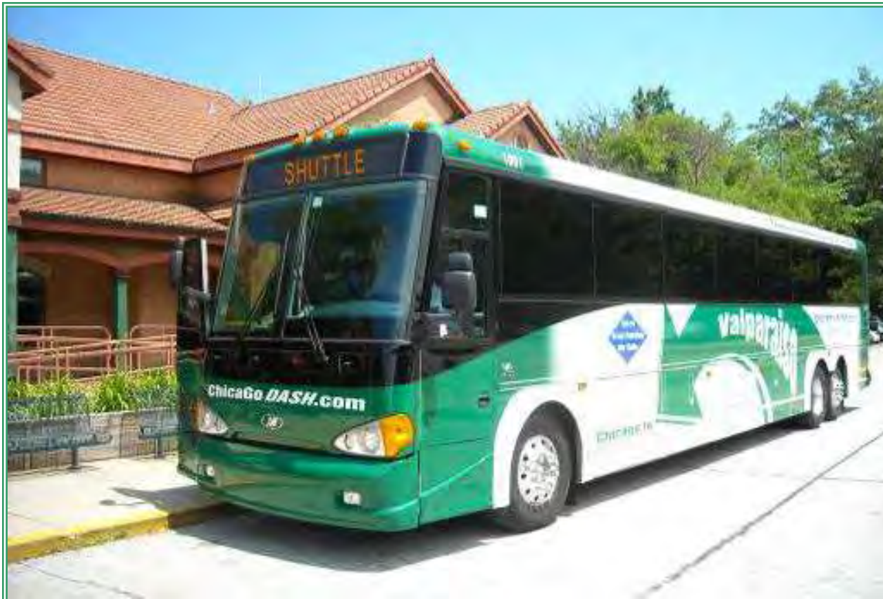
City of Valparaiso, Redevelopment Commission