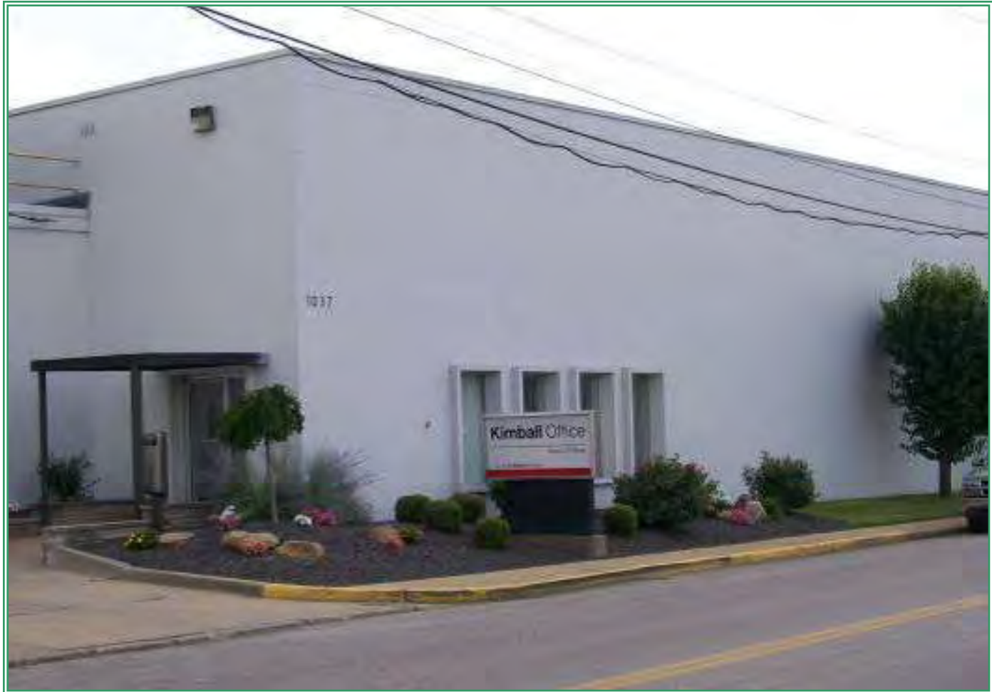
Kimball Office - Jasper