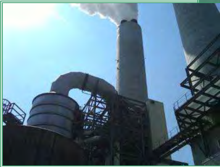
Scrubber and exhaust