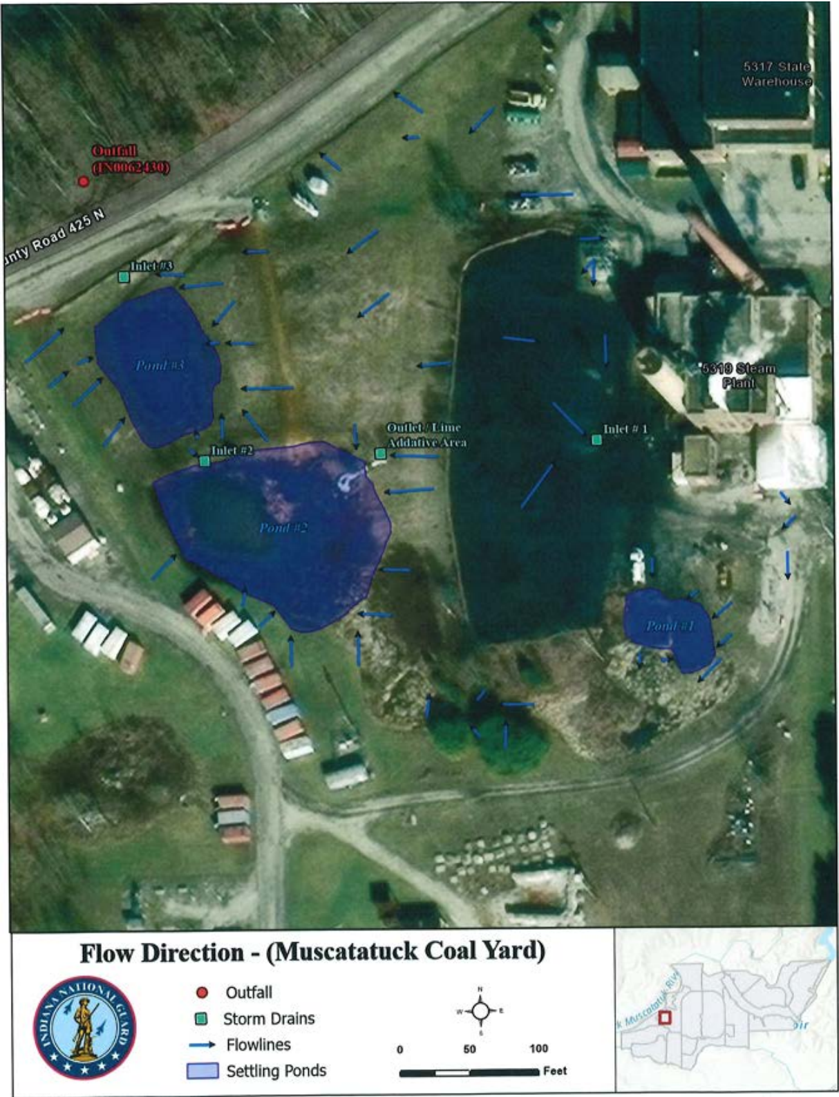
Figure 1: Facility Location

4230 East Administration Drive Butler, IN – Jennings County