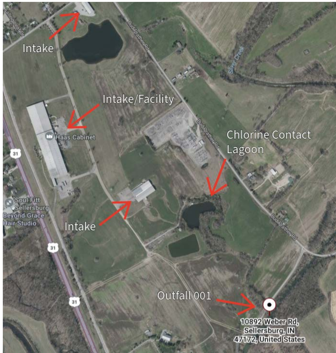
Figure 1: Facility Location

4414 Bud Prather Road Speed, IN – Clark County