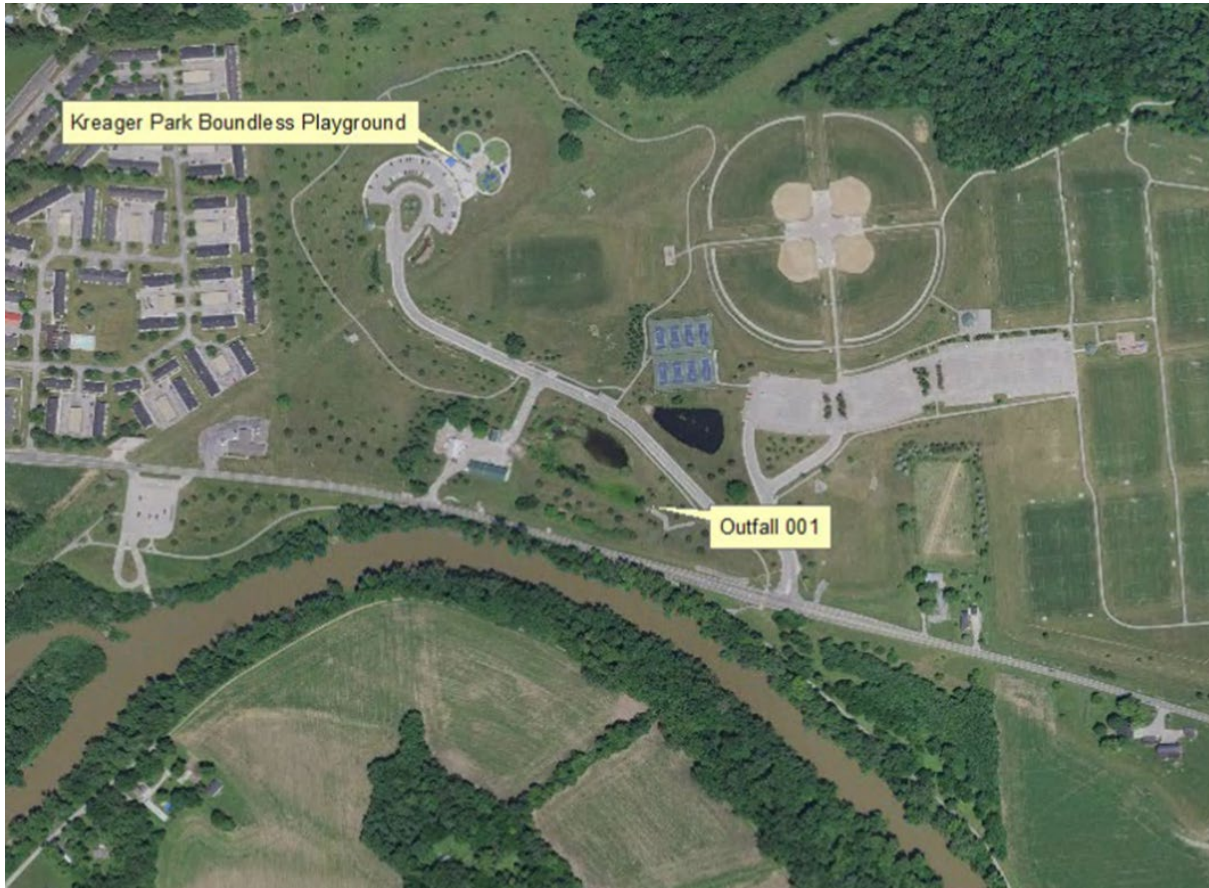
Figure 2: Site Map

7225 North River Road Fort Wayne, Indiana 46815 Allen County