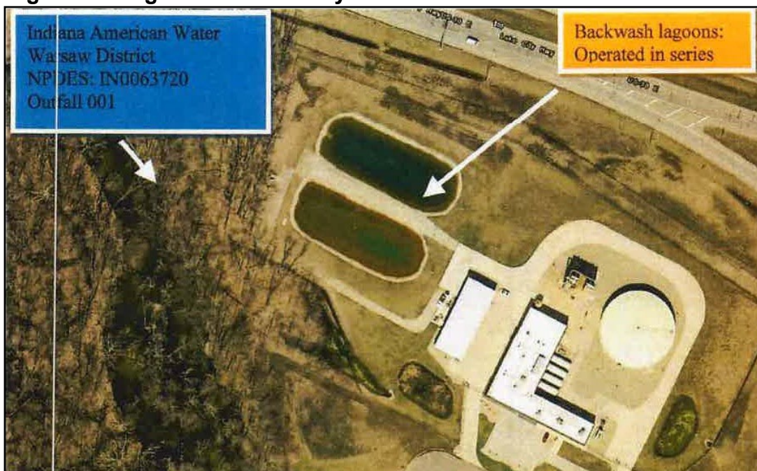
Figure 2 – Lagoon Treatment System

An aerial photo of the lagoon treatment system and Outfall is provided in Figure 2 below.