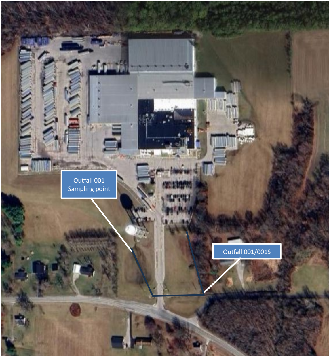
Figure 1: Facility Location

1402 W State Road 256 Austin, IN, 47102 – Scott County