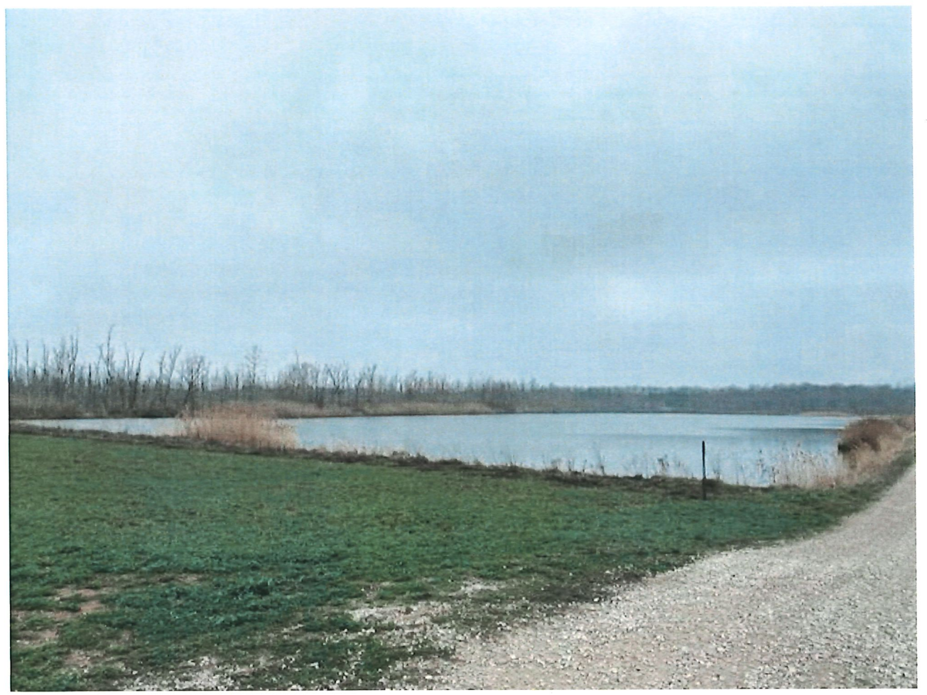
Pic. 03/06/2024 ... showing the sediment basin #SP-115, outfall 115. The land use has been approved as a permanent impoundment.

8. Hydrologic Balance (Continued) Sediment Basin #SP-115, Outfall 115: