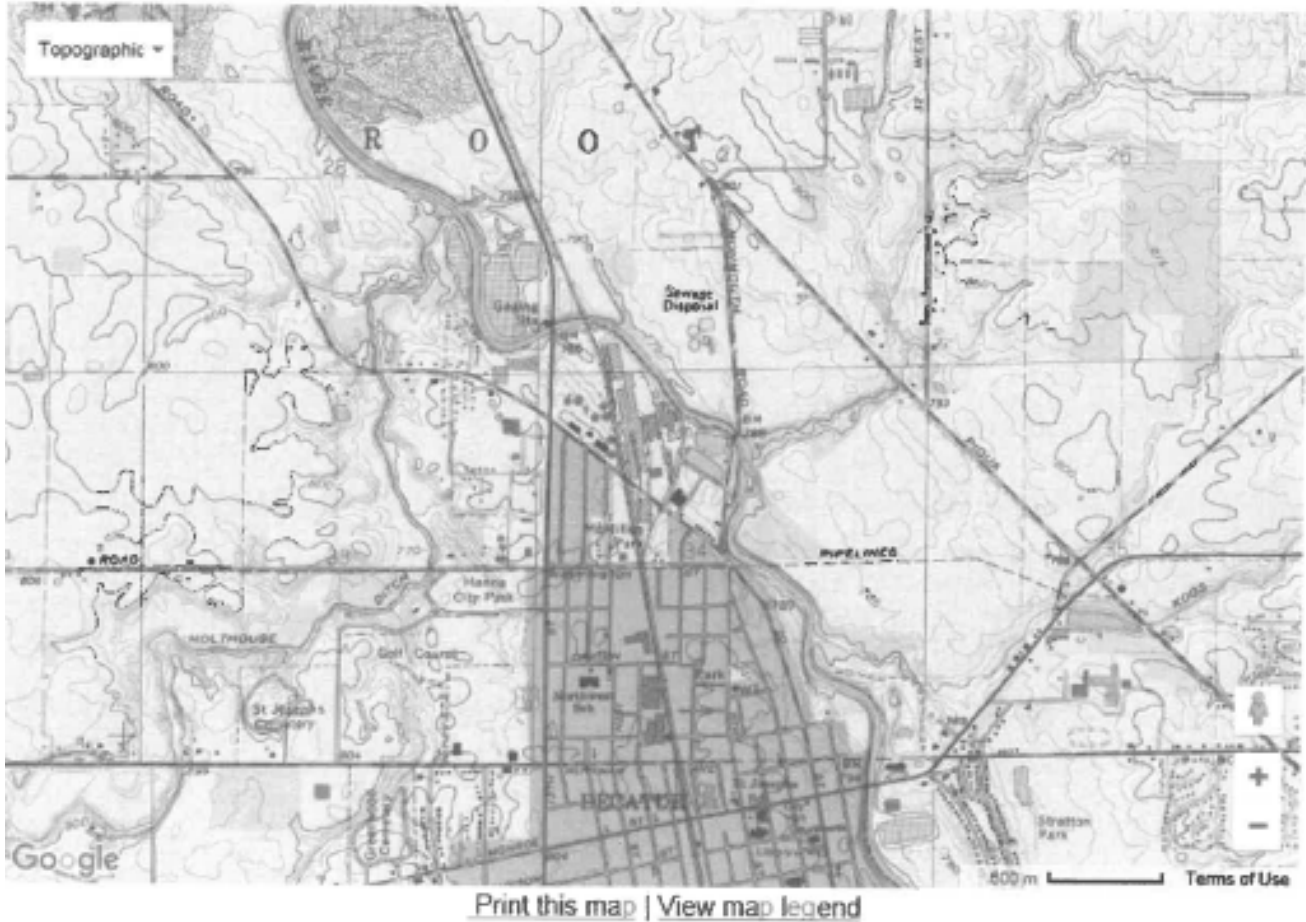
Figure 1: Facility Location

A map showing the location of the facility has been included as Figure 1.