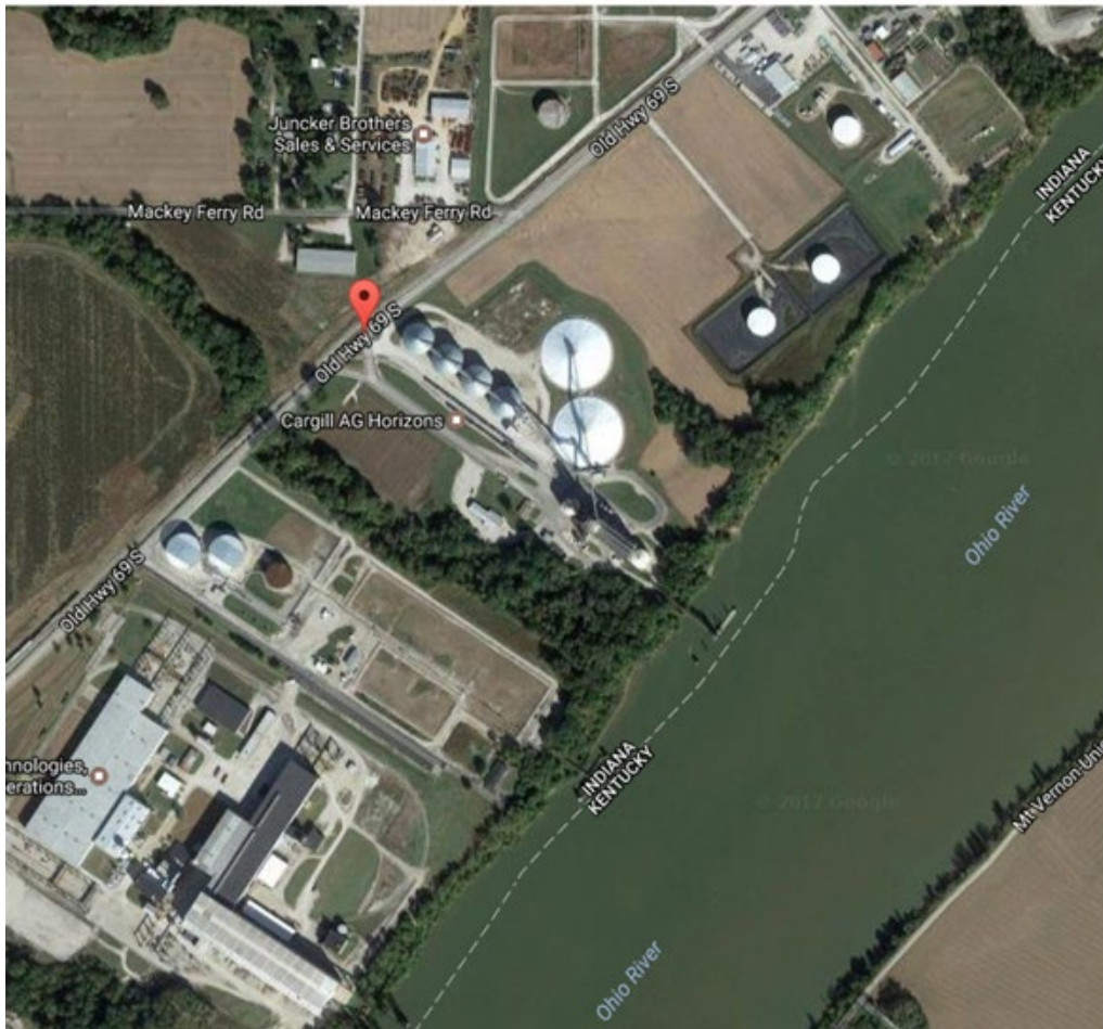
Figure 3: Site Map