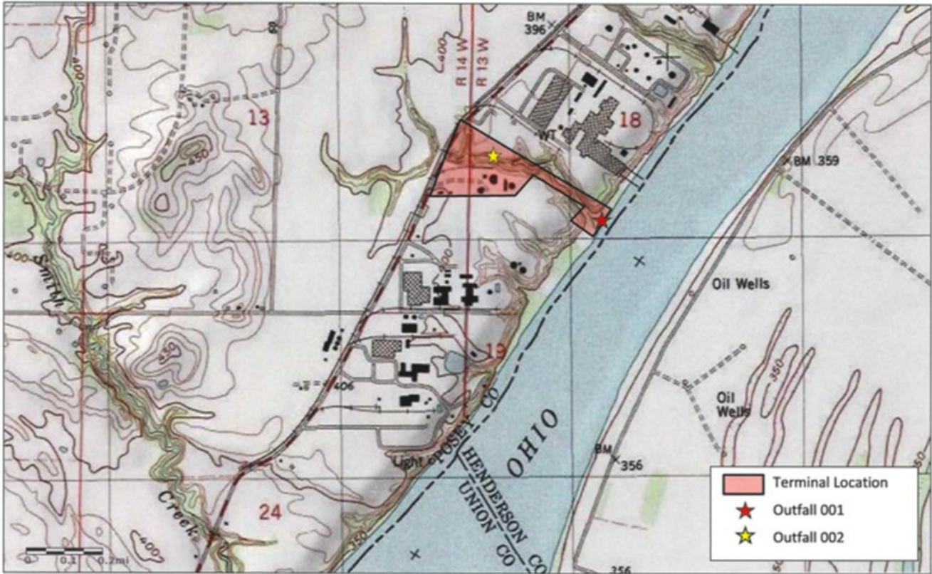
Figure 1: Facility Location

1500 Old Highway 69 South Mount Vernon, IN 47620