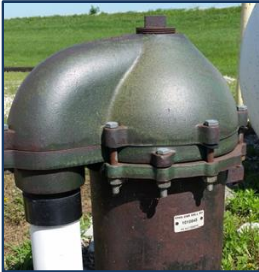
Example of a turtle back well with an access plug.

The access plug is typically on top of the well cap. Use a wrench to remove the plug in this well cap. WD-40 may help if the plug is rusted shut. If it still cannot be removed, the entire cap can be removed (see the next section). Once the plug is removed, set it in a sanitary location. The top of the hole in the cap is the measuring point. Once you are finished measuring, return the plug to the cap and tighten it.