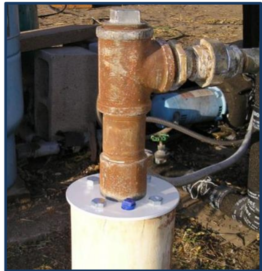
Example of a sanitary seal well cap with access plug.

Unscrew the plug (it should be on the opposite side of the cap from the power outlet) from the cap using a wrench. Set the plug in a sanitary location. The measuring point is the top of the hole in the cap. After you have finished your measurements, return the plug to the cap and tighten it.