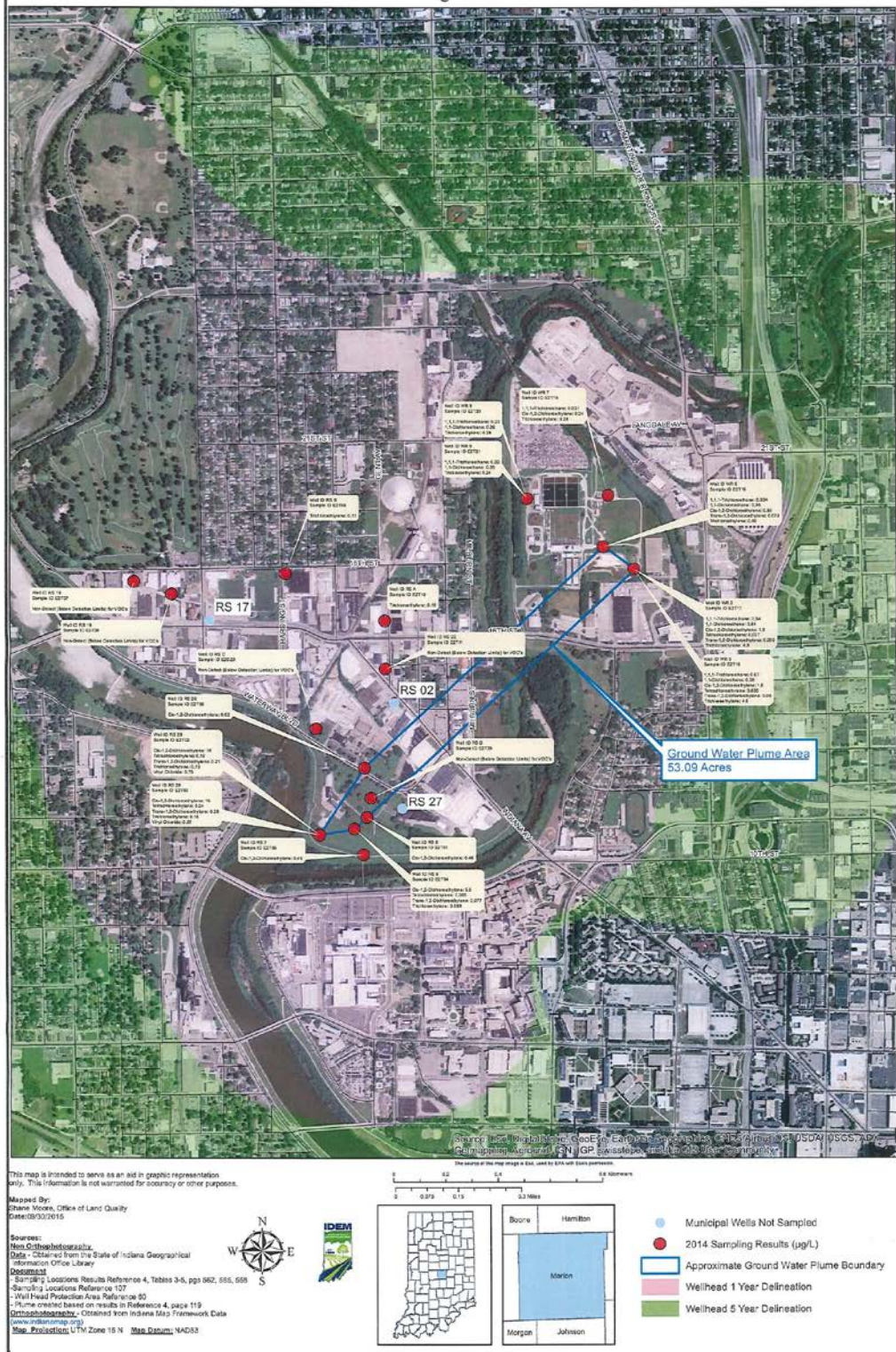
Riverside Ground Water Plume Boundary Map Indianapolis, Marion County, Indiana Fig. 1-2