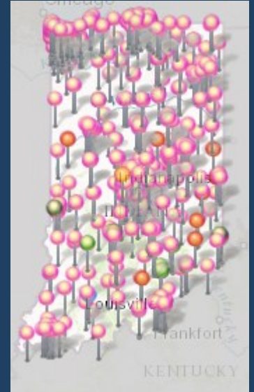
Snapshot of the interactive map on OptIN showing which locations distribute Naloxone to laypersons.

An individual can buy naloxone through a doctor's prescription or through the ISDH's standing statewide order, which eliminates the need for a prescription. "Indiana knows all too well the toll that the national opioid epidemic is taking on communities and families," said Jerome Adams, M.D., M.P.H., Indiana's state health commissioner. "By getting naloxone into the hands of emergency responders and lay people, we can save lives and give people who are struggling with addiction a second chance." People who can get the medication include a person at risk of experiencing an opioid-related overdose or a family member, friend or any other individual or entity in a position to assist an individual who may be at risk of experiencing an overdose.