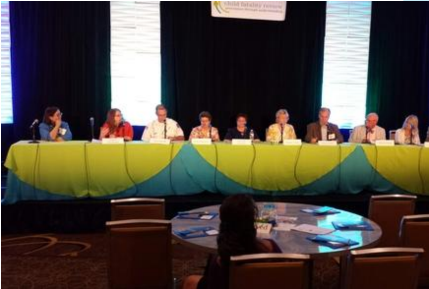
Mock Review Panel at the First Annual Child Fatality Review Conference

The inaugural Child Fatality Review Conference held on June 12 at the Sheraton Indianapolis Hotel- Keystone at the Crossing provided meaningful education and interaction with local and national experts on child fatality review, injury prevention and coalition building. The conference highlighted the need for partnership building, identifying champions in our local communities, providing education to diverse CFR teams, and developing sustainable action plans to prevent child injury and death and keep our kids healthy and safe.