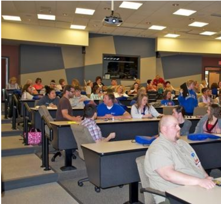
District 7 Trauma Tour Summer 2013

From June through August, the Indiana State Department of Health will hold a statewide Trauma Tour. Division of Trauma and Injury Prevention staff, along with local stakeholders, will hold "open house" style meetings in all 10 Indiana public health preparedness districts for Hoosiers to learn more about trauma, how state and local agencies currently respond to trauma and how an integrated trauma system could help the state.