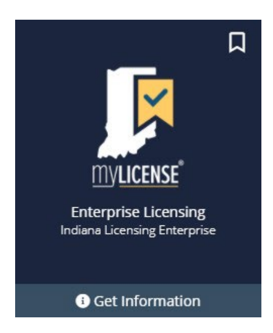
Step 7. Click on the Log In tab on the top left side of the page.

Step 8. Click on the Business or Individual tab on the top left side of the page and begin your new or renewal application.