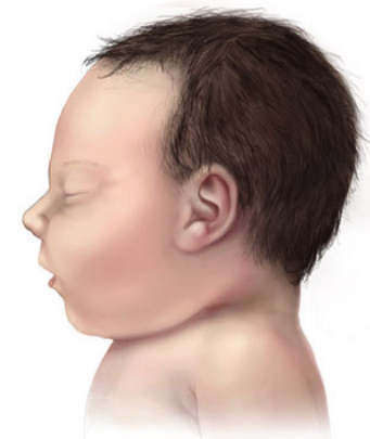
Baby with Typical Head Size