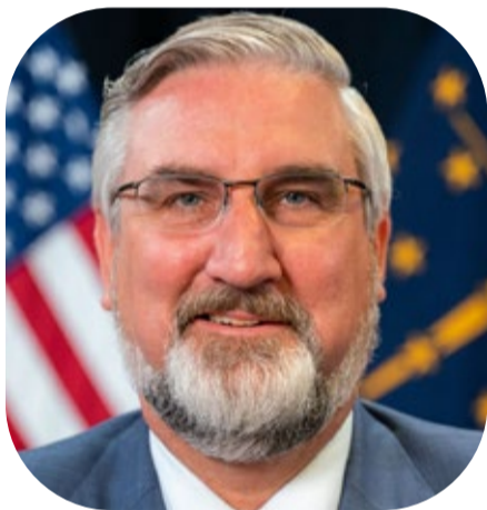
Hon. Eric J. Holcomb Governor