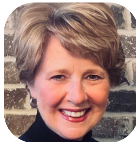
Hon. Susan W. Brooks Citizen Advisor