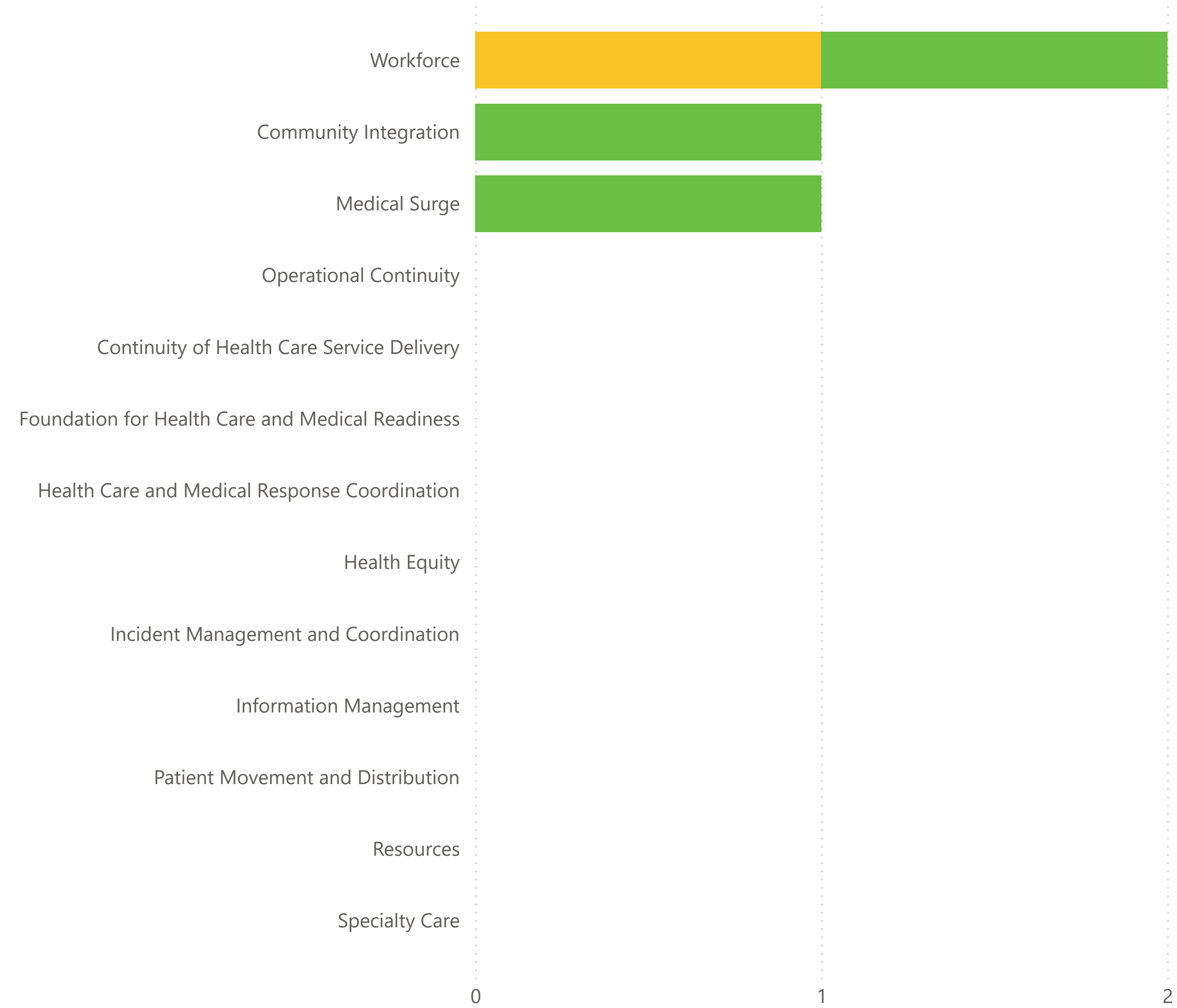
Identified Barriers by Capability