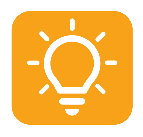
Innovation & Adaptability