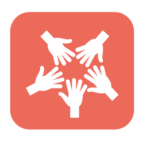
Partner Engagement & Collaboration