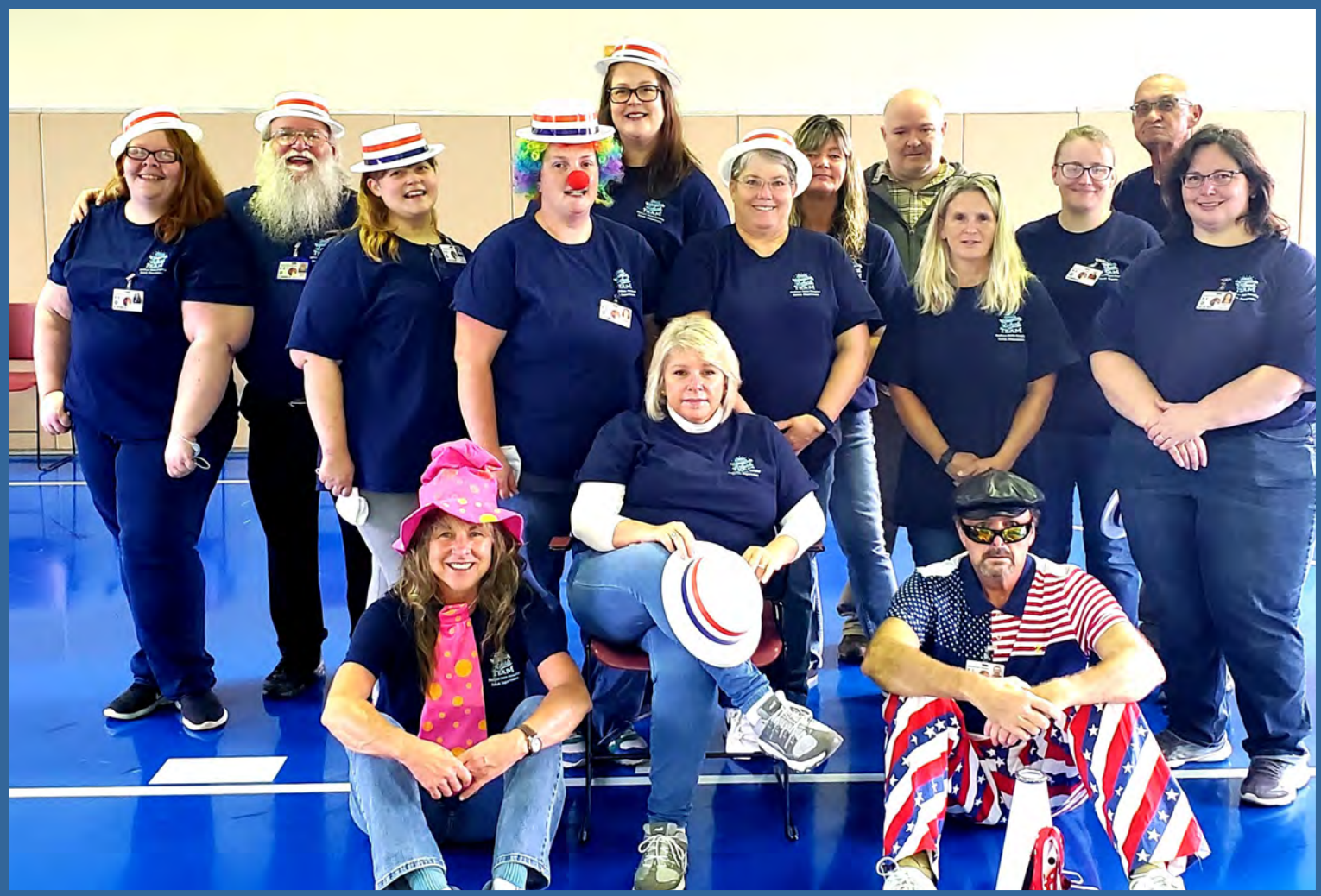
The Rehab Department was very busy last Thursday. They celebrated Rehab Month with matching t-shirts and lunch. Afterwards, they hosted the Fall Carnival for the patients.