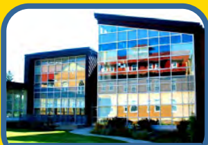
Madison State Hospital

VISION: Safely deliver meaningful, quality, and compassionate, psychiatric care to our patients and their families.