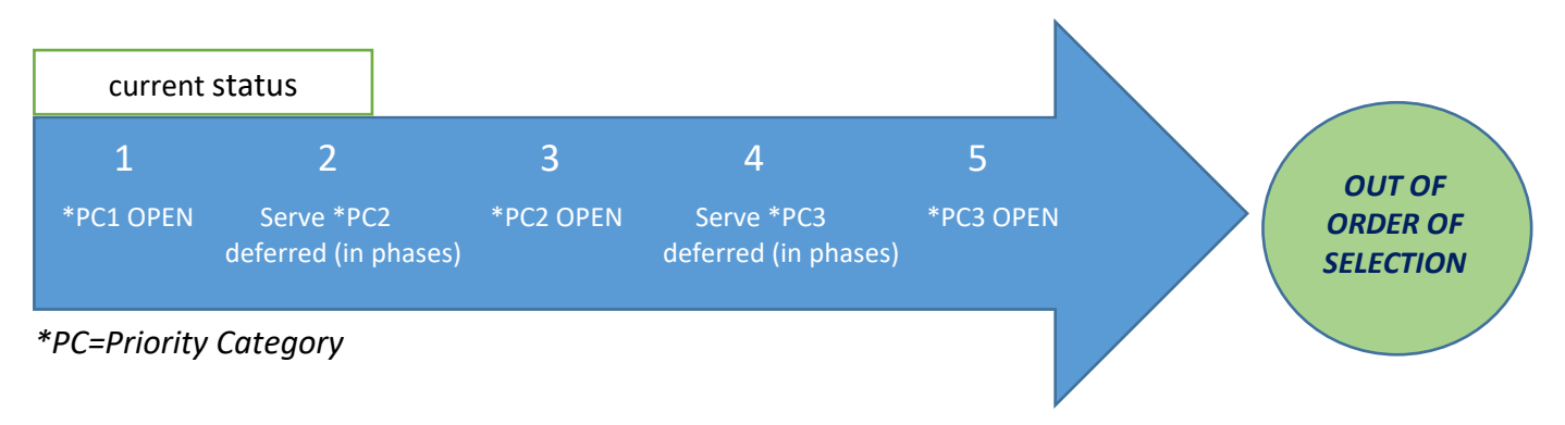
Step 1: Since the implementation of the order of selection in 2017, all eligible individuals assigned to priority category 1 have continued to receive VR services with no waiting period. In SFY22, this represented

The graphic below outlines the sequential steps that must be followed in serving individuals in delayed services status, in order of priority and application date as outlined in the VR section of the Workforce Innovation and Opportunity Act state plan as approved by the Rehabilitation Services Administration. An order of selection must be implemented on a statewide basis, in accordance with the Rehabilitation Act.