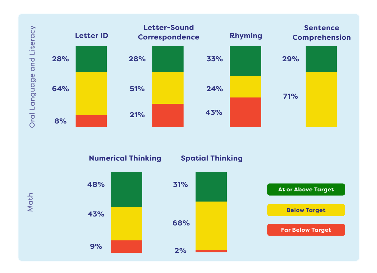
Figure 2: Students Performing Above Target

Figure 1 illustrates student performance on each KRI skill. Students in green are at or above target scores; students in yellow are below target scores; and students in red are far below target scores.