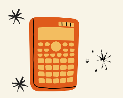
Ask about compensation too quickly. Wait until you've gone through at least two rounds of interviews.