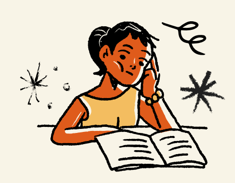
Narrow your search. Always seek out all potential opportunities wherever you can find them.