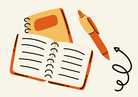
Do your research! Understand what the company do, their culture, and about this position.