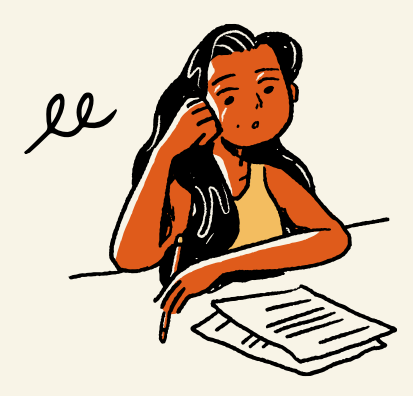
Prepare for your interview! Have a career coach look over your resume.