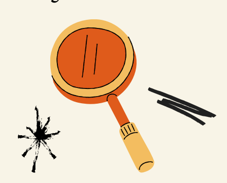
Attend career fairs and network with employers. Ask about what skills you can bring to them.