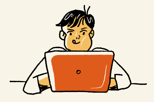
Look for the right job that fits your interest, background, and skillsets.