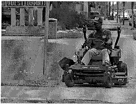
City of Gary lawnmowing at City Hall 5/4/2009 12:45PM (1 album)