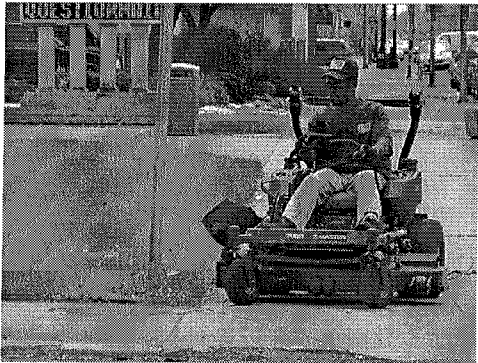
City of Gary lawnmowing at City Hall 5/4/2009 12:45PM (1 album)