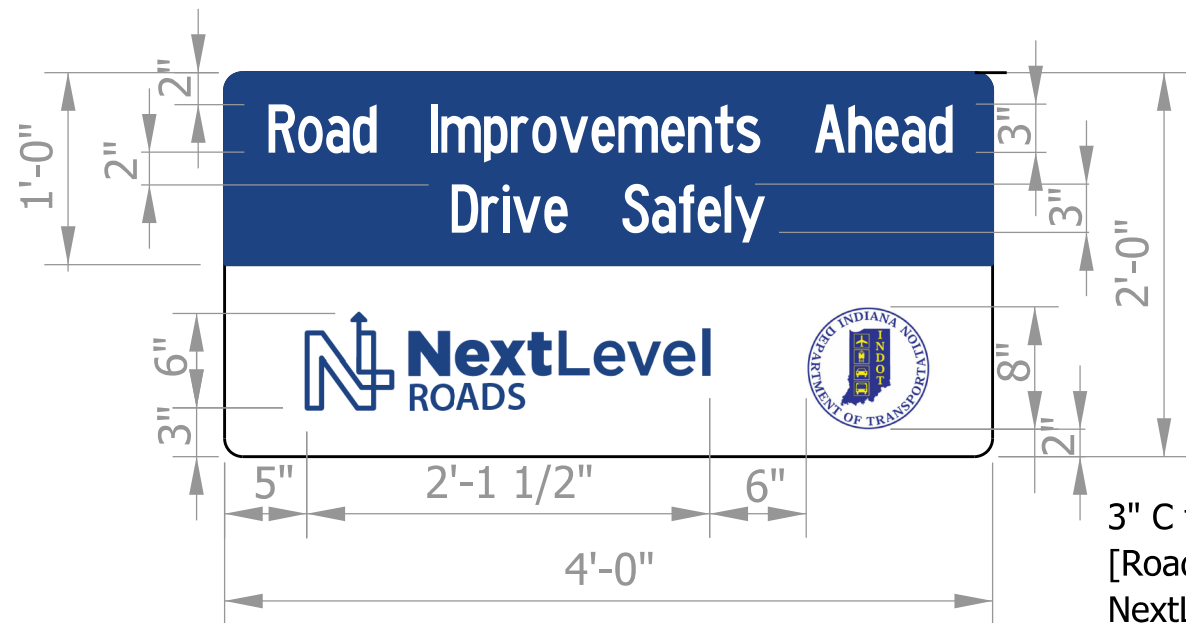
REDUCED SIGN SIZE ④

3" C font; upper and lower case; 1.125" radius; [Road Improvements Ahead] C; [Drive Safely] C; NextLevel Roads graphic; INDOT Seal