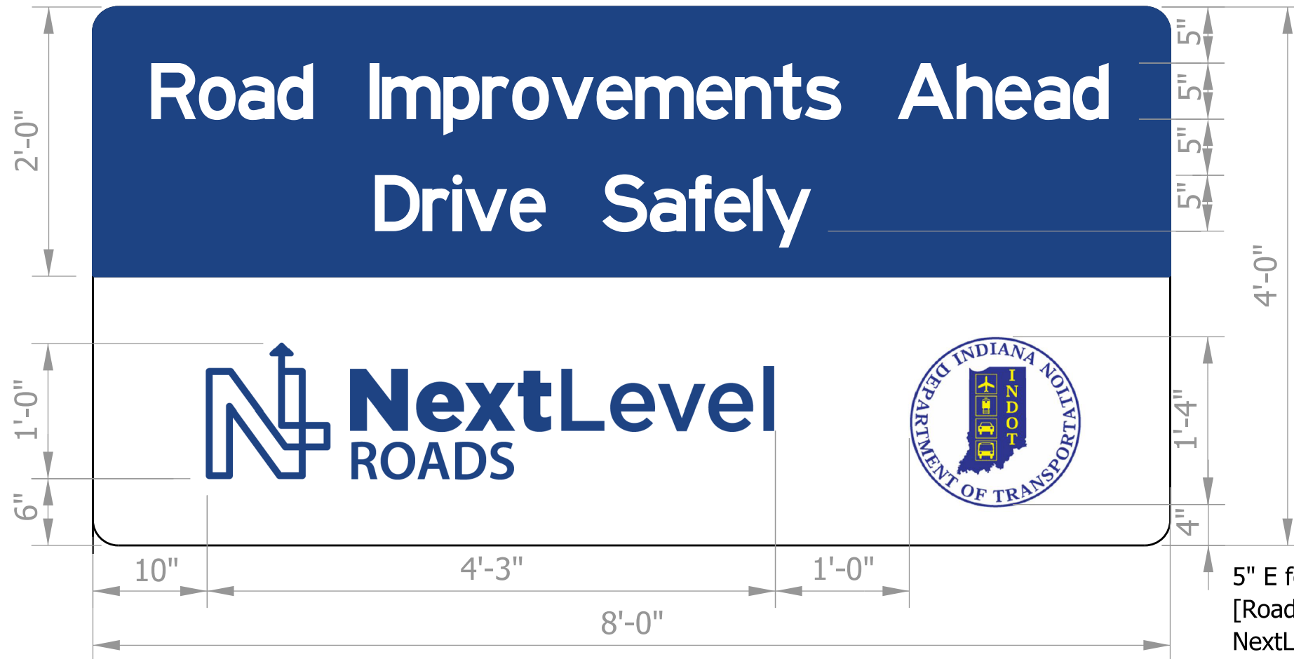
STANDARD SIGN SIZE

5" E font; upper and lower case; 2.25" radius; [Road Improvements Ahead] E; [Drive Safely] E; NextLevel Roads graphic; INDOT Seal