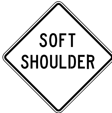
XW8-4-A XW8-4-B (1)