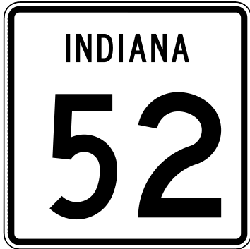
WHITE BACKGROUND WITH BLACK LETTERS, NUMERALS AND BORDER

M1-16 M1-16a M1-16-A M1-16a-A M1-16-B M1-16a-B