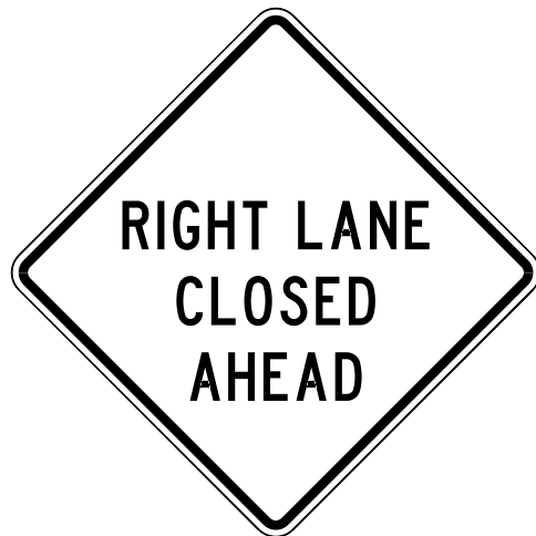
XW20-5 (R,L, or C) (10)