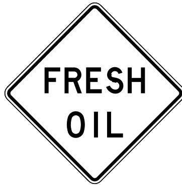
XW21-2 XW21-2-A (9) (1)