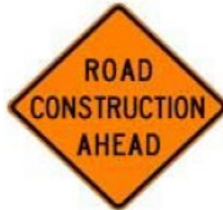
W20-1 48 inch x 48 inch