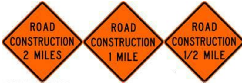
W20-1 48 inch x 48 inch