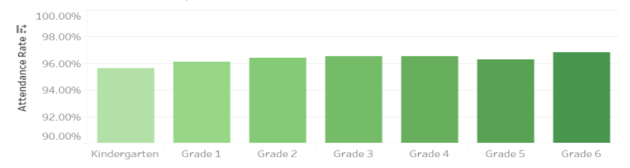
School Attendance Rate by Grade at BCSC in 2018

Research supports a strong correlation between student attendance and academic achievement. According to <u>Brookings Institution</u>, "Physically being present in school is one of the most basic conditions for a student's success – if students are not in school, they are not learning what is being taught and could be falling behind in earning the course credits needed to graduate."