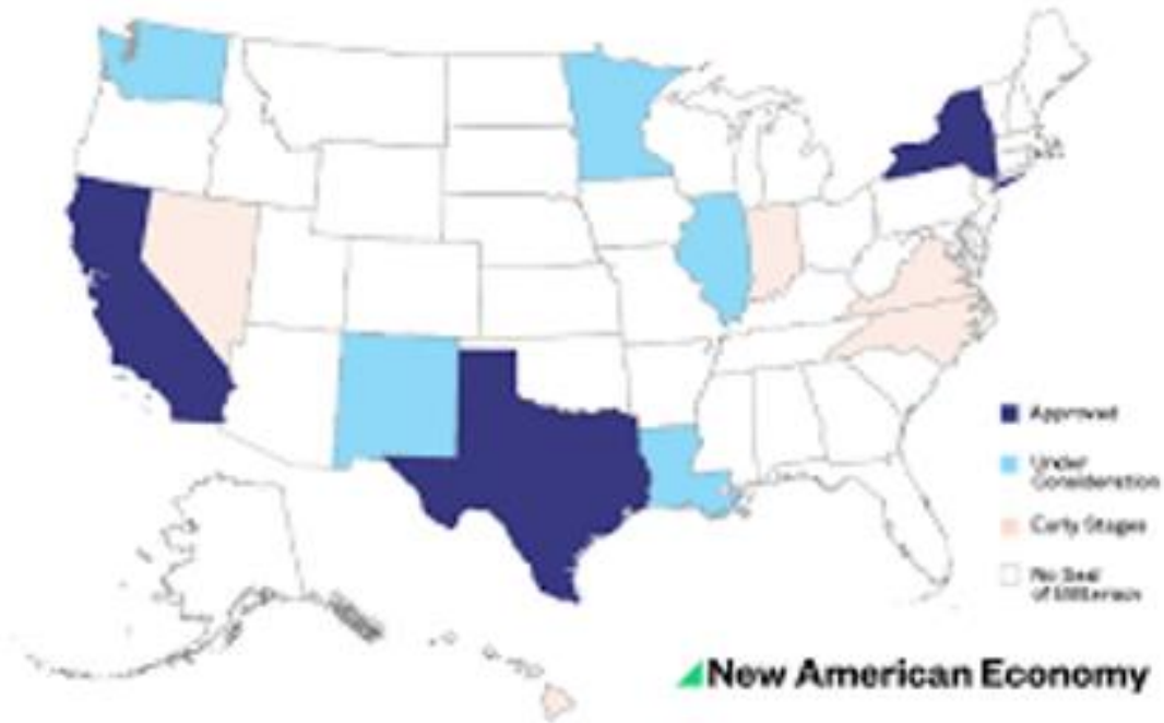
States that have Adopted the Seal of Biliteracy – August 2013