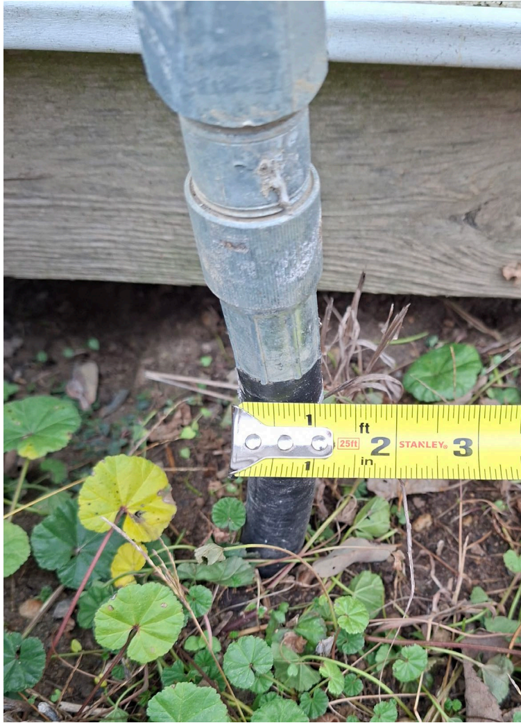
Gas Line to Heater