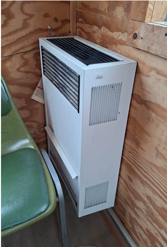
Williams Brand Heater

Images for reference regarding questions above: