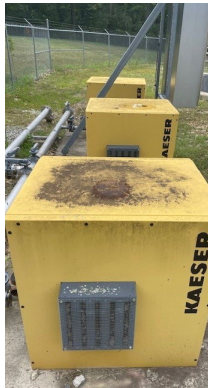
Blowers and Control Panel

D. Site Photographs showing existing conditions as of August 2024. Field Verify all existing conditions.