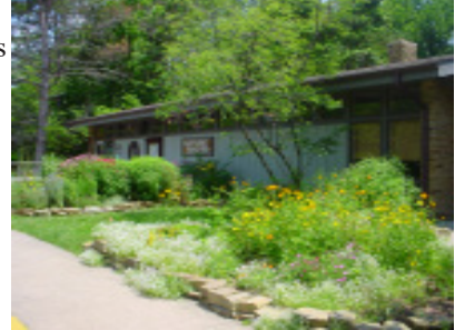
Visitors to Brown County's Interpretive Center are greeted by a garden of native flowers