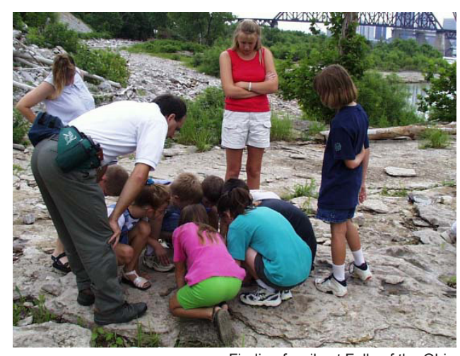
Finding fossils at Falls of the Ohio