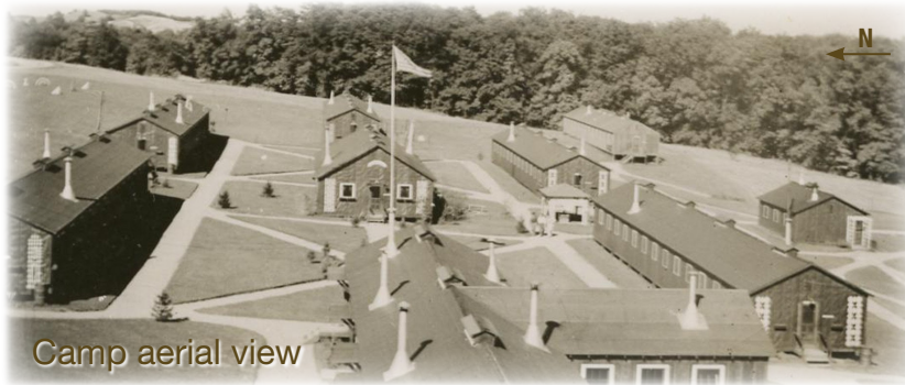
Camp aerial view