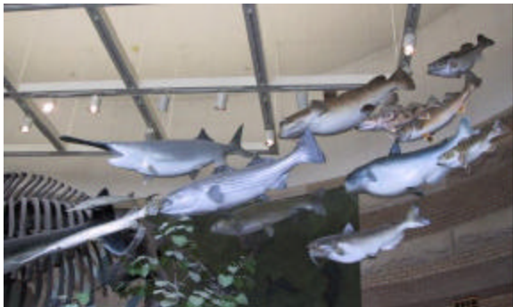
Ohio River Fish in Interpretive Center Lobby

12. Go to a pond and have students compare the ecosystems of the pond to the river. Direct them to make charts of the different kinds of living things found in both systems.