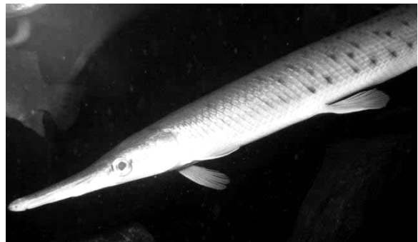
Short-nose Gar in the Ohio River aquarium at the Interpretive Center

8. Add a life cycle to their picture of river life.