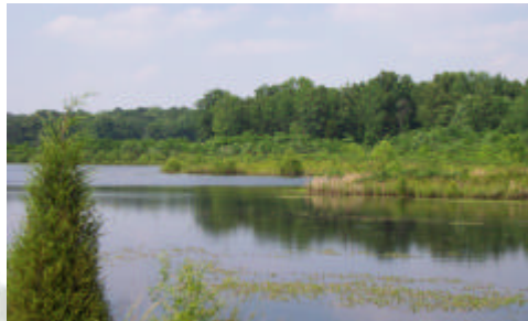
Deer Ridge Mine