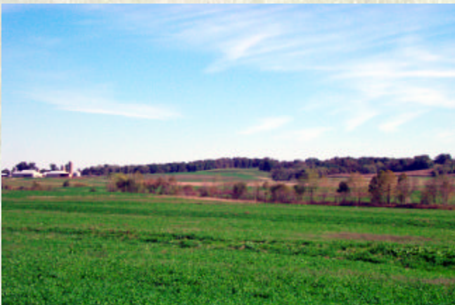
Sky-Point Mine 25 th Anniversary Gold Award Winner