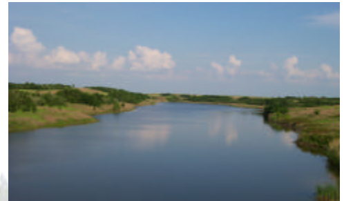
Ayshire Mine - Blue Grass Creek Area

The Regulatory Program is responsible for permitting and compliance verification, enforcement and financial assurance of comprehensive environmental protection performance standards related to surface and underground coal mining operations. Half of the 3.2 million cost of the regulatory program is provided through Title V federal grants through the Office of Surface Mining on a matching basis. The other half is provided through fees levied on coal production. Maintaining adequate fees to support the mandated activities of the agency has been a constant concern in recent years. The Division meets its statutory mandates through an annual work effort that includes: