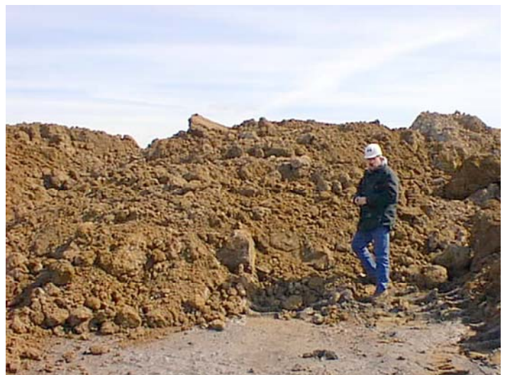
On this site, the coal mine operator has restored more than double the amount required for successful restoration.

Operators must complete the final grading in a timely manner; usually in time for the next growing season. This includes any subsoil or topsoil replacement and installation of erosion control measures such as terraces, diversions, grass waterways and drains.