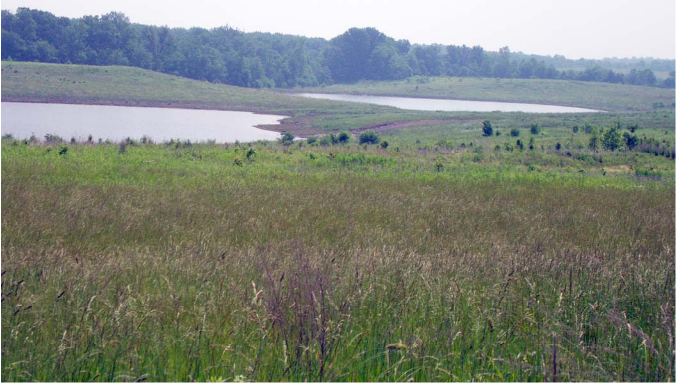
2000 National award winning reclamation at the Columbia Mine