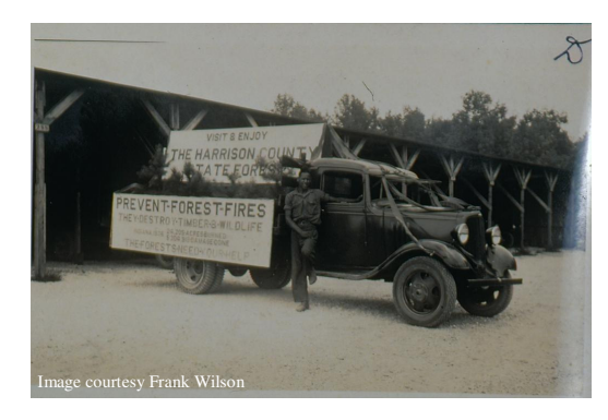
A CCC worker posing by a truck loaded with trees for planting

Indiana had fifty-six CCC companies, eight of which were African American. Despite wording in the legislation that created the CCC that disallowed discrimination, the program was segregated based on race because of the prevailing racial attitudes of the day. The 517th, which had about two hundred and fifty men, was the largest and most enduring of Indiana's African-American companies. Other African-American companies were stationed in Bloomington, Mitchell, Evansville, Cromwell and several other locations throughout the state.