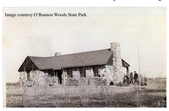
Property Manager's residence, built by the 517th in 1937

The park offers modern electric campsites and primitive and youth camping in the nearby Stagestop Campground. Indiana's first natural and scenic river, Blue River, flows through the state park and forest with a canoe access ramp in Stagestop Campground. The Corydon Capitol State Historic Site is located near the park. Visitors can learn about early Indiana history as they tour the old town square and the beautiful first state capitol building,