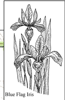
Blue Flag Iris

From North Judson go 5 miles east on SR 10 to CR 100E. Turn north on CR 100E, then east on CR 500S. Turn north on CR 150E and go 0.5 mile to a lane leading east into the preserve. You may park in the turn-around at the end of the lane.