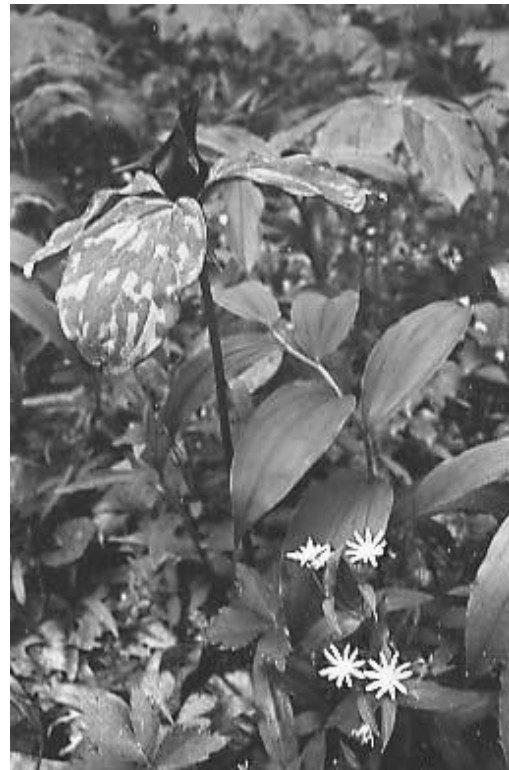
Trillium and Chickweed