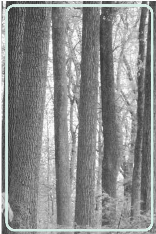
View from the Tall Timbers Trail