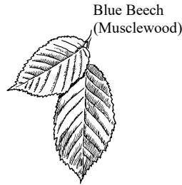
Blue Beech (Musclewood)